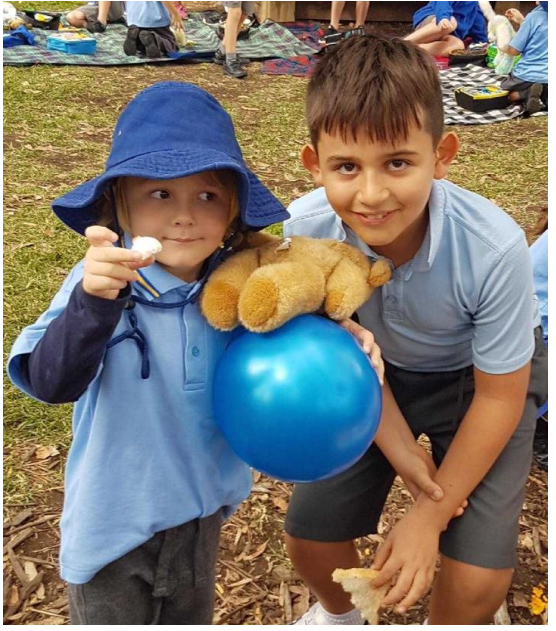
Better Buddies Teddy Bears Picnic. Year 6 with their Kindy Buddies.