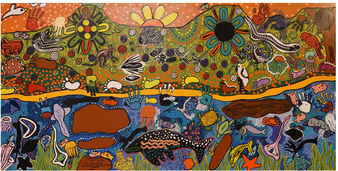
This mural was created in June 2022 by Indigenous and Non-Indigenous students from Lindsay Park Public School, with the assistance of local Aboriginal artists from the Coomaditchie United Aboriginal Corporation.